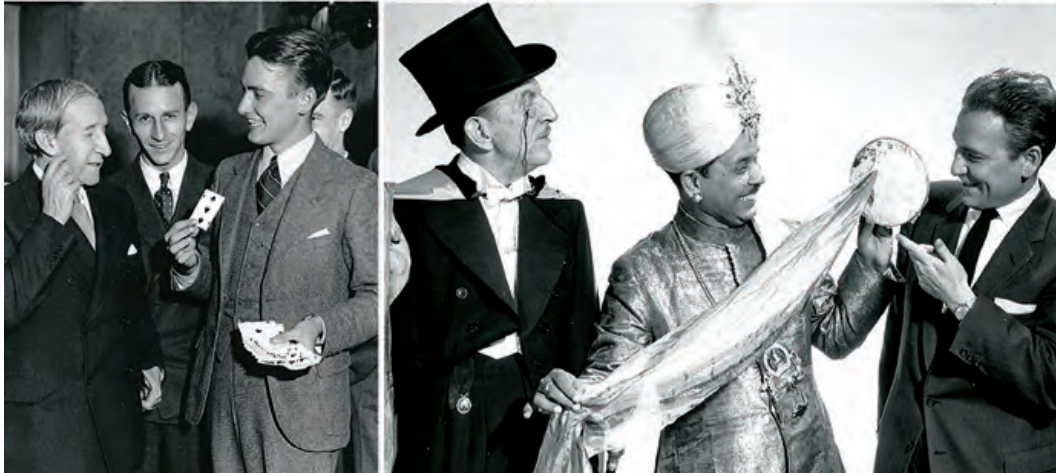
Top, left to right: Milbourne and Maureen Christopher. • Publicity photo of Milbourne Christopher. Bottom, left to right: A young Milbourne Christopher entertains Howard Thurston. • Cardini, Sorcar, and Milbourne Christopher.

Mr. Christopher performed his first magic show at age twelve. By age twenty-one, he could add entertaining President Franklin D. and First Lady Eleanor Roosevelt to his resume. In addition to his full-evening show, he produced and performed in the first television magic special, The Festival of Magic , broadcast on May 27, 1957, on NBC-TV.